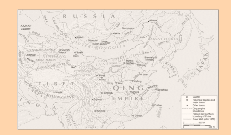
Panel II: China and its Muslim Borderslands: Global Entanglements and Contestations

Panel I: Conceptions of China and its Place in the World: Historical Perspectives