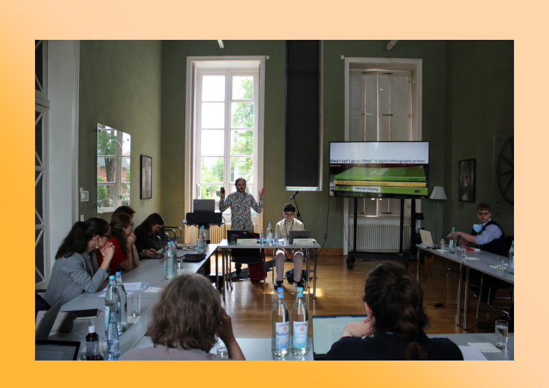
TRANSFER AND NETWORKING

world across the globe: Asia - Europe - USA